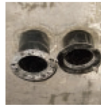
Sleeves stuck in concrete after pour