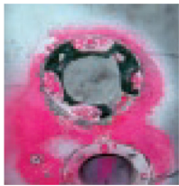
Concrete filled sleeves