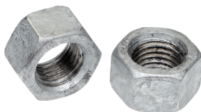
HOT DIP GALVANIZED