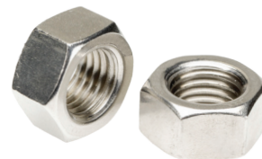
STAINLESS STEEL TYPE 18-8