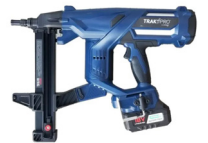
TABLE 10: ORDERING INFORMATION 9BE40 TRAK-PRO CONCRETE BATTERY NAILER